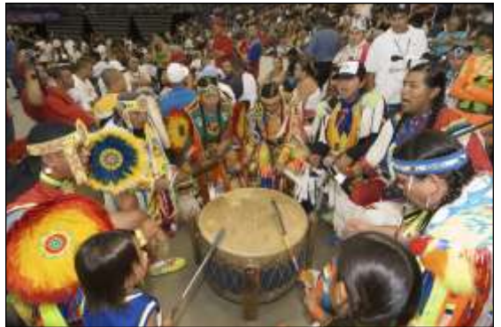
The National Museum of the American Indian National Powwow, Verizon Center, Washington, D.C., 2005.

"The music that emerges is known by names likes blues, country western, folk ballads, and gospel. The sounds are as sweet as mountain air and as sultry as a summer night in Mississippi delta country. The instruments vary from fiddle to banjo to accordion to guitar to drum. But a drum in the hands of an African sounds different than one in the hands of a European. And neither is the drum-beat of an American Indian. Yet all the rhythms merge, as do the melodies and harmonies, producing completely new sounds – new music. The music merge[s] because this is America. New waves of music ride ashore in the hearts and heads of new immigrants and they create still new sounds from what they have brought with them and what they find here. And nothing expresses the tensions or the triumphs – of this journey into democracy quite like the music it spawns.