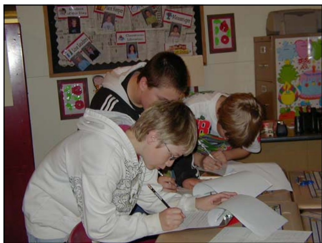
Greenbush students participated in a scavenger hunt while at the museum during a class field trip in May. These young people are in one of the classrooms designed by the Women in Education committee.

At 200 rails a day, it would take a farmer 75 days to split the rails necessary to enclose 160 acres with a _____ fence in 1860. The answer is hidden somewhere within the newsletter articles. Submit your answer for a drawing for a picket.