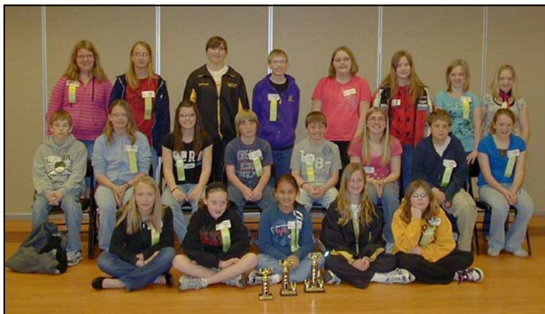
2008 - 09 NW Minnesota 6th Grade History Contest Winners